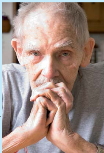
Fred Pohl

And they all answered — construing “they” to mean almost anyone on the payroll before 1938 changed their lives. Isaac picked John Campbell to query, having thought to write a story to show the manuscript to the editor to start the ball rolling. John detected the ms. in John’s hand, read it swiftly, and rejected it with a 45-minute lecture on how not to write SF. Isaac then wrote another story, which produced the same experience. The third one, however, Campbell bought, thus quickly promoting Isaac to the status of professional writer.